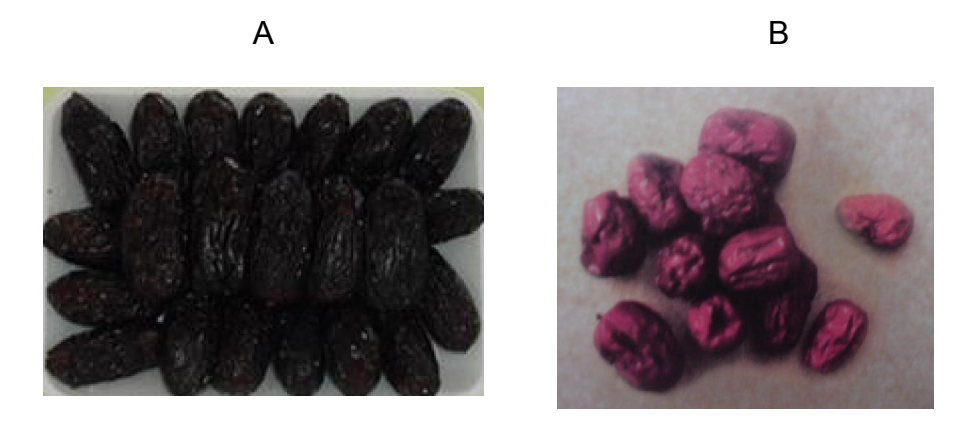
Fig 1. A: Safawy (Phoenix dactylifera) and B: Chinese date (Ziziphus zizyphus).