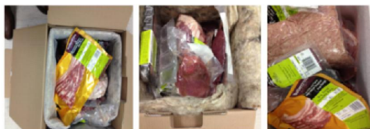
Figure 1. Sample boxes with meat (left-right: Woolcool® lined, Woolcool® unlined, expanded polystyrene )

Woolcool® (WCUN) and one EPS. A 10 kg variety of fresh meat products (beef, pork, lamb joints) were packed into each box (Figure 1), and left unrefrigerated for 72 hours. The boxes were then opened, and swabs taken from the top, middle and bottom surface of each box and from the condensed liquid found on the surface of meat packs. Samples were also taken from the lamb shoulder joint from each box. They were then analysed for microbiological contamination as described below.