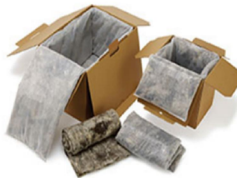
Figure 1. Woolcool® packaging liners for boxes 1

potential as a packaging liner for the transport of meat (Fig. 1).